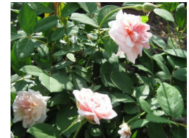
Cecile Brunner Rose