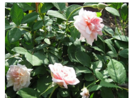
Cecile Brunner Rose