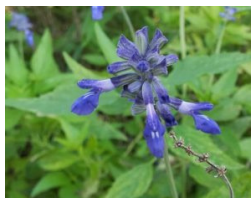
Mealy Blue Sage